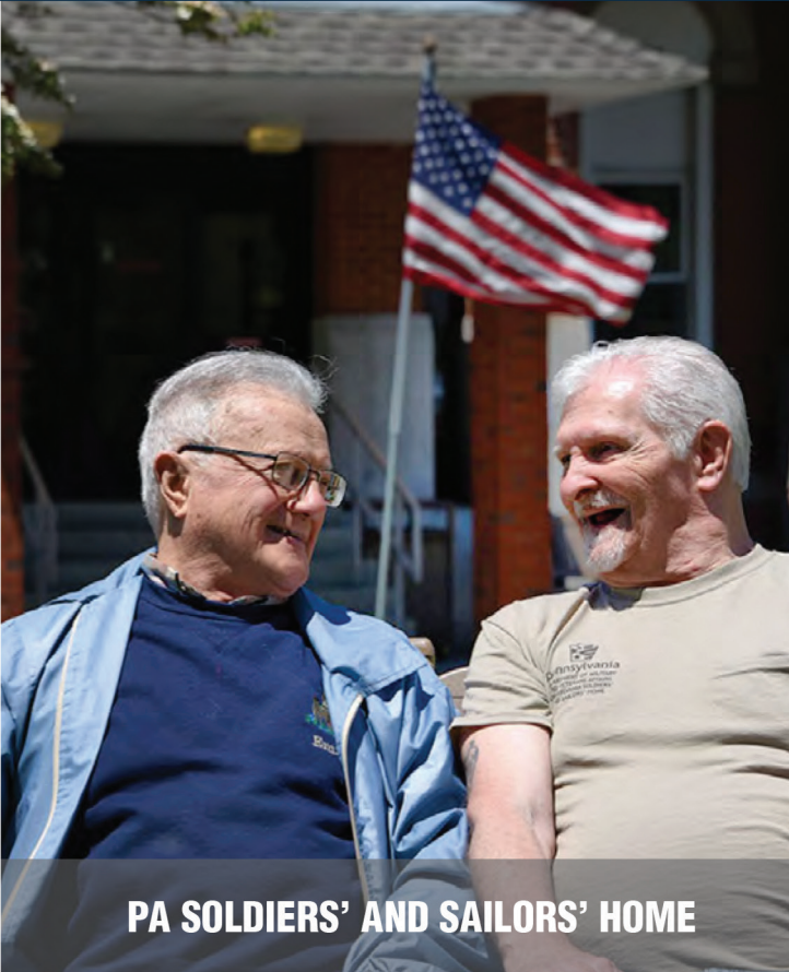
PA SOLDIERS' AND SAILORS' HOME