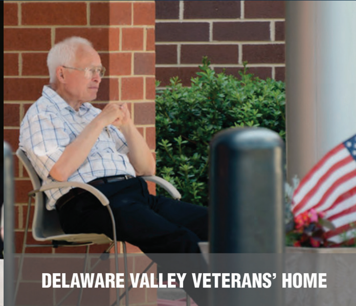
DELAWARE VALLEY VETERANS' HOME