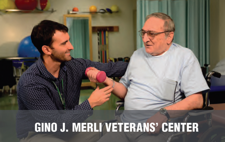
GINO J. MERLI VETERANS' CENTER