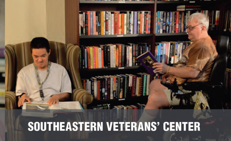
SOUTHEASTERN VETERANS' CENTER