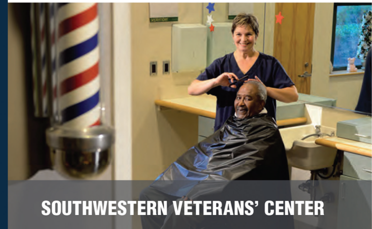
SOUTHWESTERN VETERANS' CENTER

DMVA Office of Veterans Affairs Bureau of Veterans Homes Bldg. 0-47 Fort Indiantown Gap Annville, PA 17003-5002