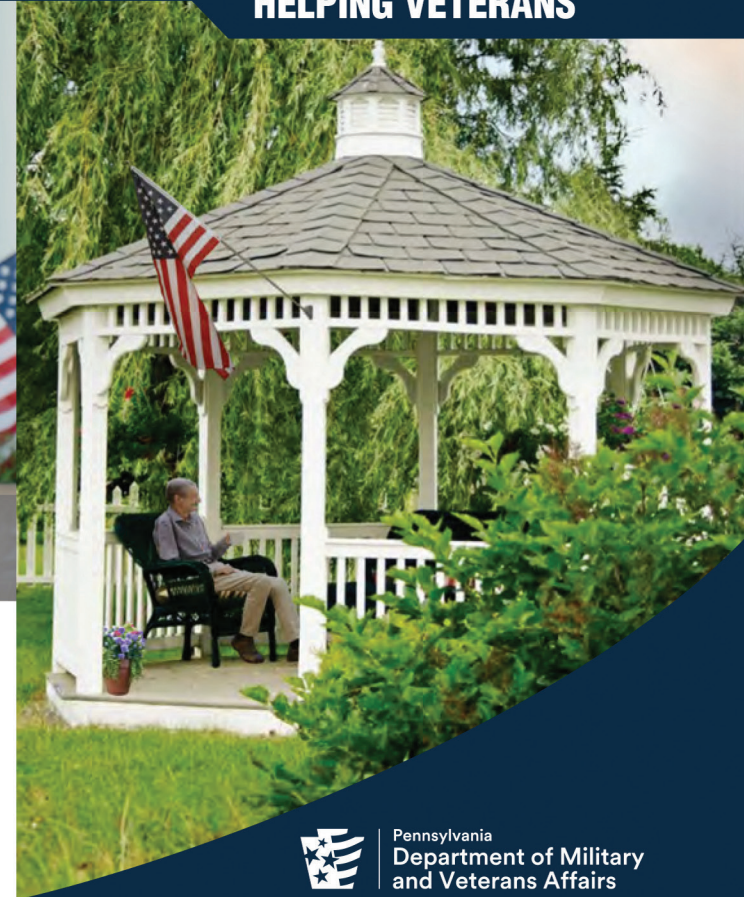
Pennsylvania Department of Military and Veterans Affairs